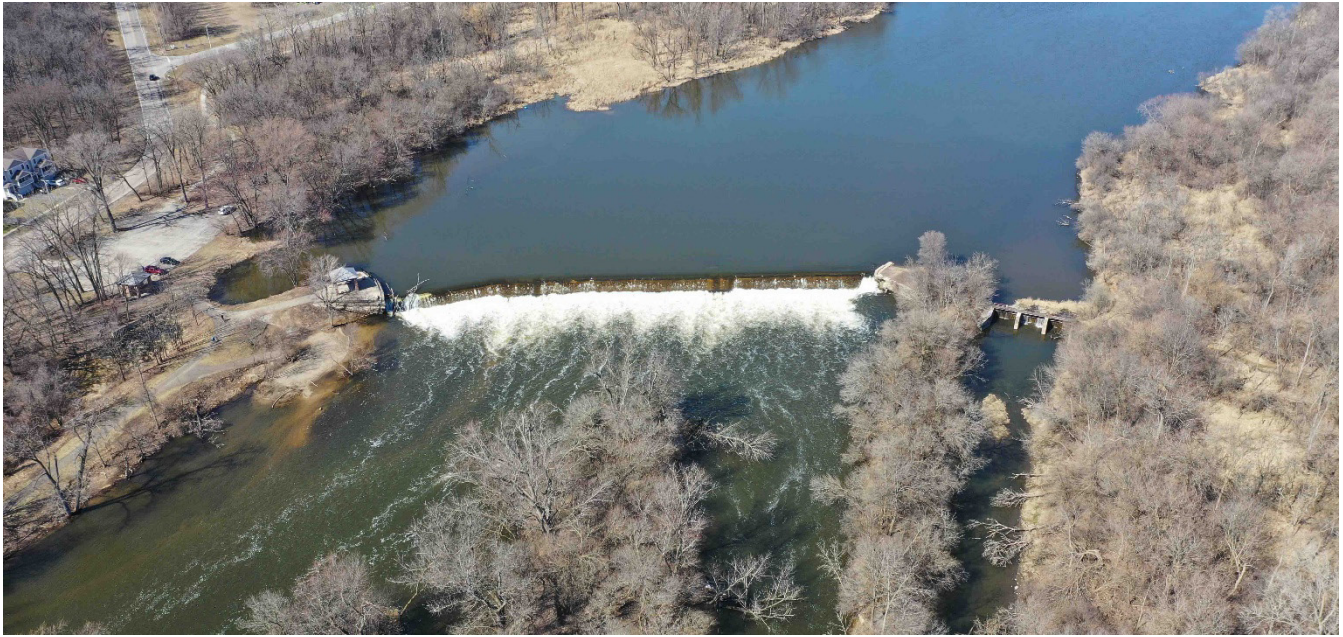
Kane County Forest Preserve District