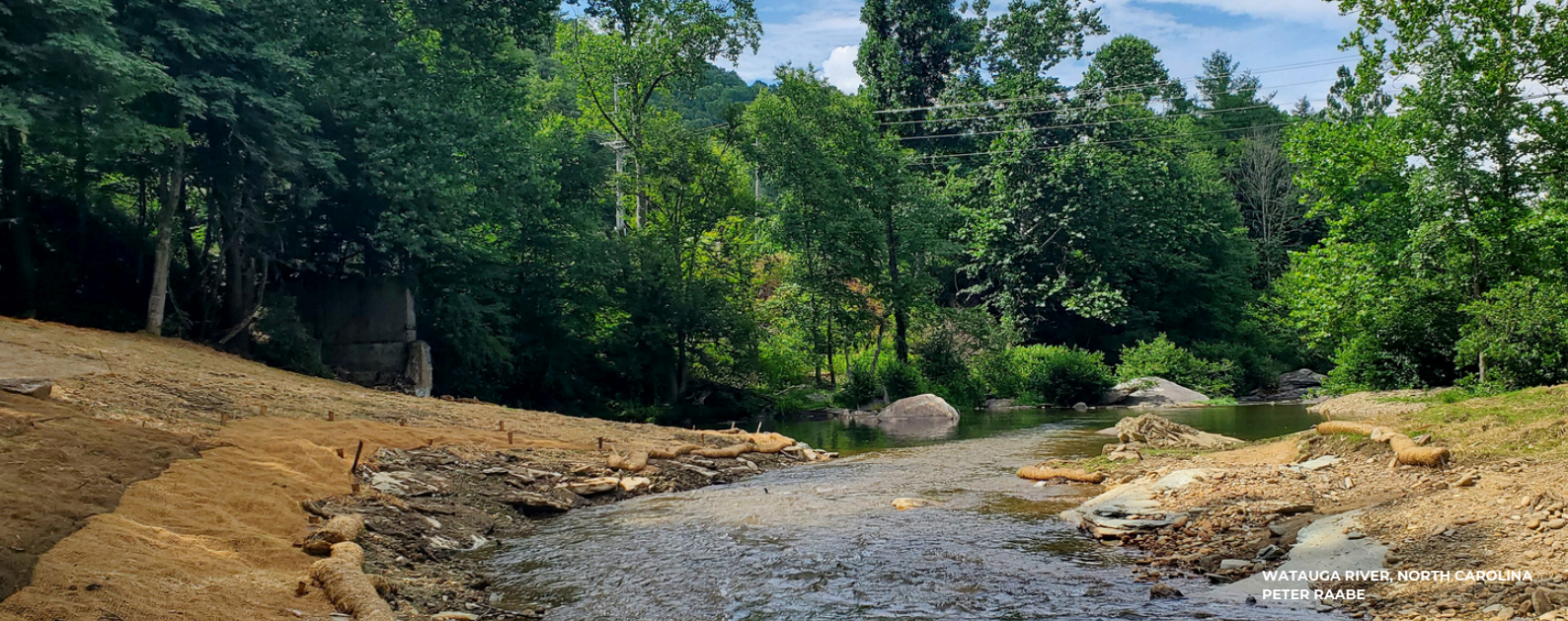
WATAUGA RIVER, NORTH CAROLINA

Your support has helped restore 78 miles of the Watauga River in North Carolina — freeing it from dams for the first time in 150 years and reconnecting crucial habitat for threatened wildlife.