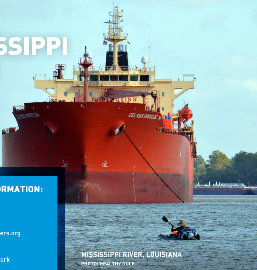
MISSISSIPPI RIVER, LOUISIANA

AmericanRivers.org/ MississippiRiver2022