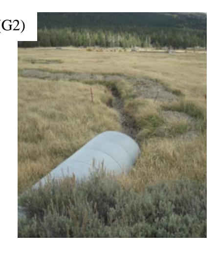
A ditch with vegetated banks in Hope Valley (Carson Watershed).