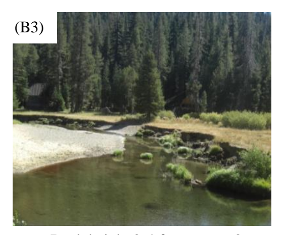
Bank height 2-4 feet. score=2 (Hermit Valley, Mokelumne Watershed)

(2) Bank Stability. A bank is unstable if one of the following features exist: Either a (1) fracture (a crack is obvious along the top or on the face of the bank); (2) slump (a portion of the bank has slipped down as a separate block of soil or sod see B2 and B3 above); or (3) slough (soil broken away or crumbled and accumulated at the base of the bank.) or if the bank is steep (within 10 degrees of vertical), and/or bare, and eroding (including bare depositional bars).