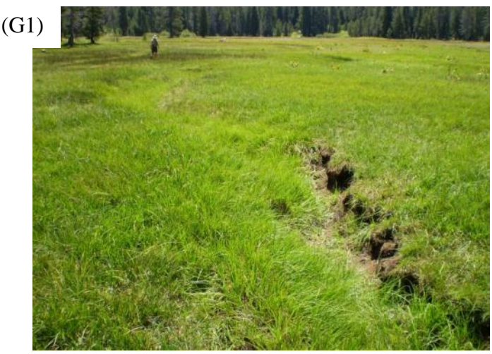
Headcut and gully forming in Freeman Meadow (Yuba Watershed)

(3) Gullies, Ditches, or Eroding Tributaries Outside Main Channel. Gullies may be the result of headcuts which have propagated upstream from an incised main channel, or they may be new channels that have formed in areas where no natural channel was present. The new channels may be due to roads, trails, or culverts concentrating flows, or the channels may be ditches purposely cut to drain portions of the meadow.