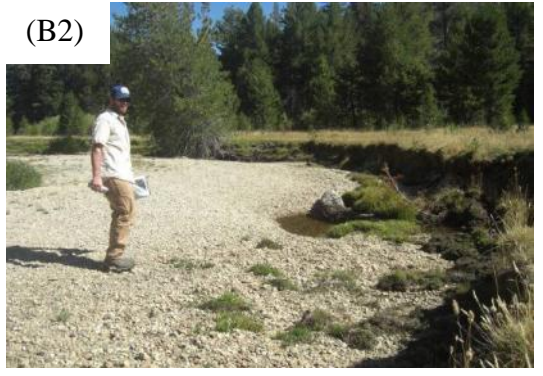
Bank height 2-4 feet, score=2 (Pacific Valley, Mokelumne Watershed)