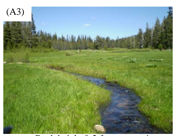
Bank height 0-2 feet, score=4 (Austin Meadow, Yuba River Watershed)