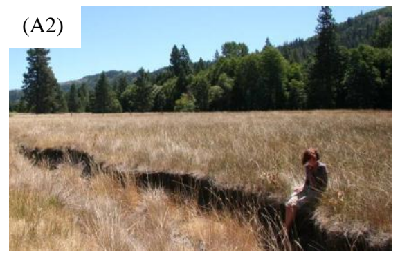
Bank height greater than 4 feet, score=1 (Bear Valley, Bear River Watershed)