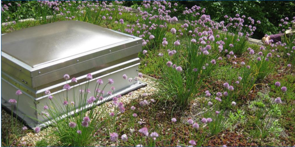
Green roof constructed under the RainScapes Program in Montgomery County, MD