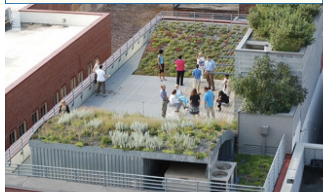
American Society of Landscape Architects

Green infrastructure can be defined as an approach to wet weather management that uses natural systems, or engineered systems that mimic natural processes, to infiltrate, evapotranspire, and/or recycle stormwater runoff. It includes practices such as rain gardens and green roofs and provides multiple benefits to communities from improved air quality to flood mitigation.