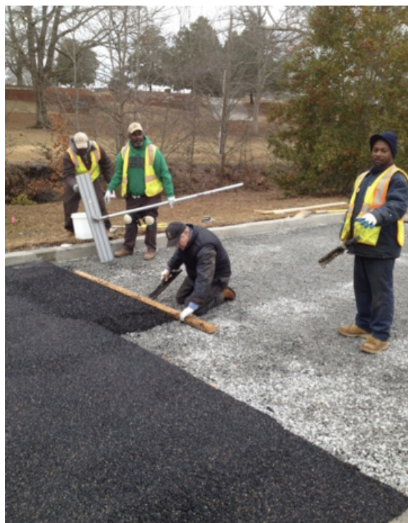
Workers install permeable pavement in Griffin, GA.

An emerging trend among stormwater utilities is the use of a credit system for landowners who install green infrastructure to reduce the stormwater generated on their property. Incorporating a credit allowance serves as an incentive for property owners to use their own funds to build stormwater controls, shifting the burden of paying for this infrastructure service from the public budget to the private sector and allowing property owners to design, install, and maintain controls that are tailored to their individual sites. One additional advantage of this shift may be that far more stormwater controls are built than would be possible through public funding alone. For example, Washington, DC has two different stormwater fees, one through the District Department of the Environment (DDOE) to fund stormwater controls required for the District’s MS4 and the Clean Rivers Impervious Area Charge through DC Water to fund stormwater controls required for the District’s combined sewer system. 84 In 2010, the District enacted new legislation to base their