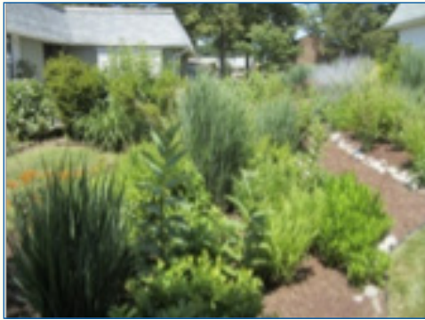
Rain garden constructed under the RainScapes Program in Montgomery County, MD