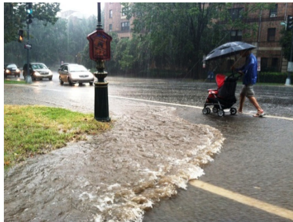
Urban runoff in Washington, DC.

Additionally, communities within the Chesapeake Bay watershed are subject to the Chesapeake Bay Total Maximum Daily Load (TMDL), which drives efforts to restore the Bay, including managing polluted urban runoff. Under section 303(d) of the Clean Water Act, every two years states must list waters that fail to meet state water quality standards. From their 303(d) lists, states must develop total maximum daily loads