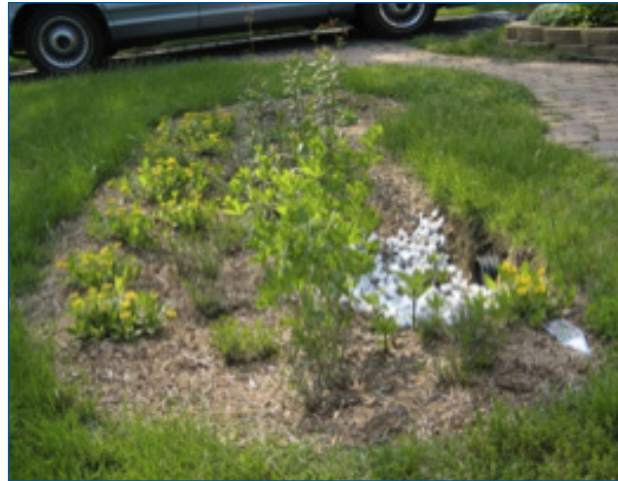
District Department of the Environment

At the minimum, these standards should include requirements for maintenance agreements between the property owner, contractor, and local government as appropriate for green infrastructure practices as part of the design process that clearly outline maintenance activities and who is responsible for them. These agreements should include the required maintenance activities, frequency of maintenance and inspections, data reporting requirements, notification requirements, easements to ensure reasonable access for municipal staff, and a requirement to prioritize hiring of pre-approved certified contractors or practitioners that have completed training in green infrastructure maintenance through the local government or through an alternative organization. 153, 154 Examples of maintenance agreements designed for green infrastructure practices include those under the Washington, DC District Department of the Environment's RiverSmart Homes Program and under Montgomery County, Maryland's Rainscapes Program. 155 See Appendix A. for a compendium of required maintenance activities and frequency of maintenance and inspections from the existing literature for various green infrastructure practices.