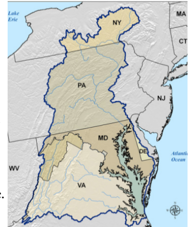
The Chesapeake Bay watershed.

The Chesapeake Bay watershed stretches across 64,000 miles and includes six different states as well as the District of Columbia. Encompassing 140 major rivers and streams as well as 11,684 miles of shoreline, precipitation that falls within this watershed makes its way ultimately towards the Chesapeake Bay. Within the watershed, a variety of land uses from forested areas to agricultural lands to urbanized areas impact the health of its rivers, lakes, streams, and coastlines. Precipitation falling on agricultural lands can pick up pollutants such as pesticides or nutrients and sweep them untreated into rivers and streams. 1 In urban or suburban areas, rainwater is unable to infiltrate into hard surfaces such as parking lots or rooftops. As a result, urban runoff flows over these hard surfaces where it picks up pollutants such as heavy metals, sediment, oil, and grease. Large volumes of polluted runoff can either flow untreated directly into local waters or overwhelm the capacity of storm sewers, resulting in sewage overflows in places with combined systems. 2 Polluted runoff is one of the only growing sources of water pollution in the Chesapeake Bay. 3