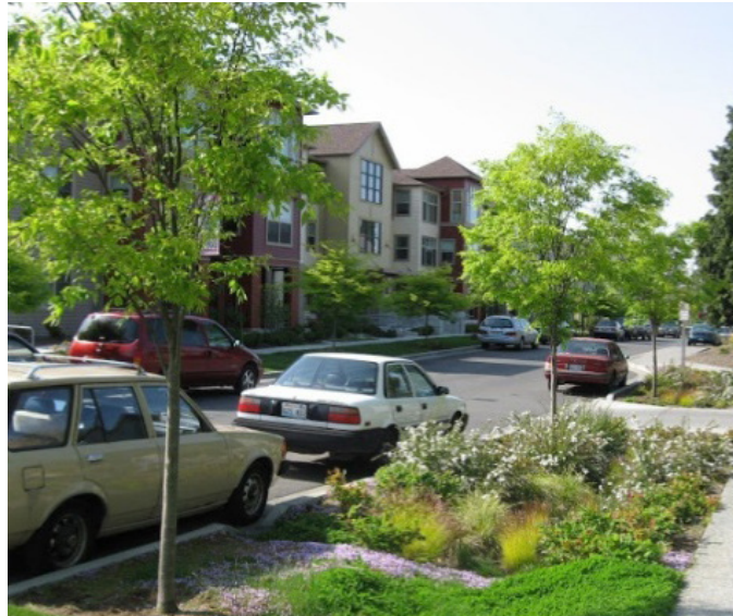
Green street in Seattle, Washington's High Point Neighborhood.

However, maintenance of some green infrastructure can differ from more traditional gray infrastructure in important ways. Green infrastructure practices are often designed as infiltration, runoff reducing, and/or vegetation-based practices. This is a different approach than many more traditional gray infrastructure practices such as curb and gutter systems or culverts that are designed to move stormwater away from roads, parking lots, and buildings as quickly as possible with little pollutant removal and volume or velocity reduction. As a result, while some maintenance activities for gray infrastructure such as detention ponds and catch basins will be similar for green infrastructure practices, others will significantly differ and require other resources and expertise.