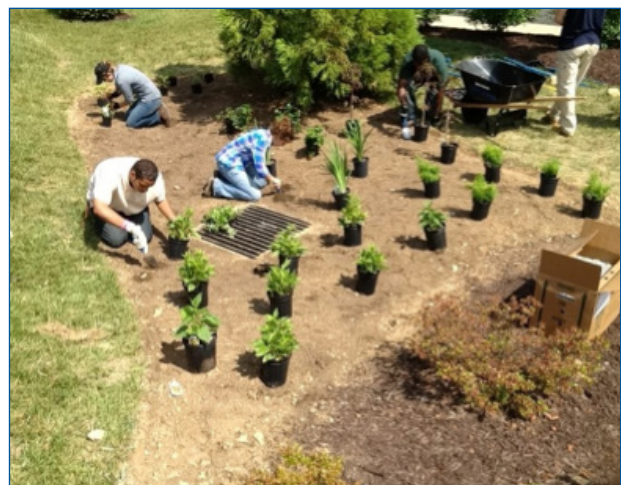
Planting rain gardens with Howard County's READY Program in Maryland.