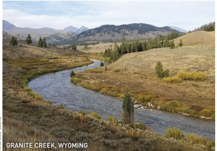
GRANITE CREEK, WYOMING

In addition to exceeding our fundraising targets, we secured a $1.4 million loan under the Payroll Protection Program, which will be converted to a forgiven grant. In addition, to maximize the value of the loan, we successfully asked foundations to convert restricted grants to unrestricted so as to fund the portion of those grants being offset by the loan proceeds. American Rivers provided staff with maximum flexibility in carrying out their jobs while balancing the demands of childcare and other responsibilities. Most importantly, keeping all of our staff employed and covered by health insurance, with no reduction in salary.